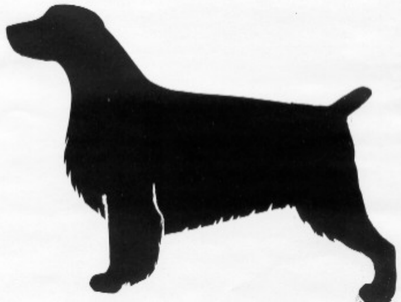
FIGURE 2 Silhouette with many failings