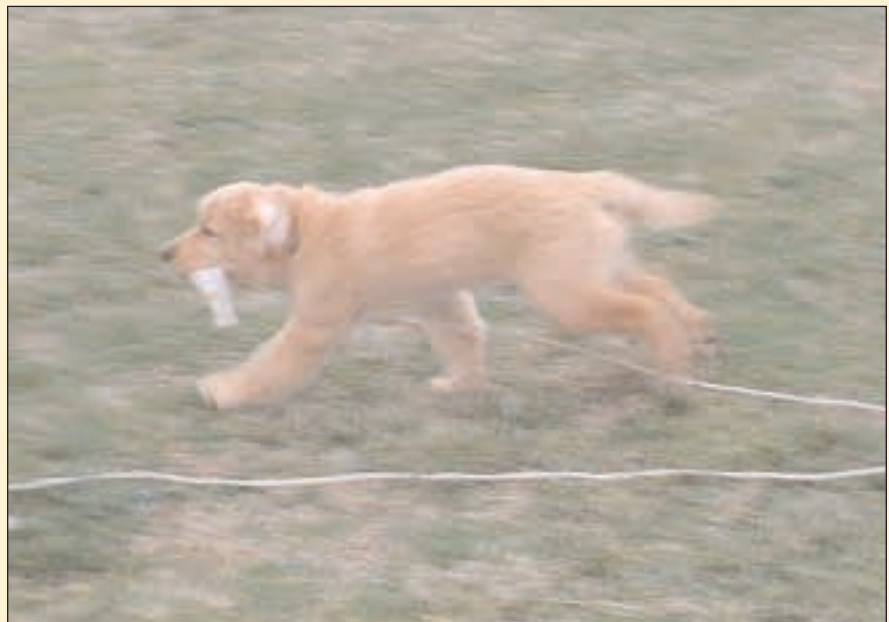
Photo 10: She knows I won't be in a hurry to grab it from her when she gets to me. Instead I pet her and praise her for coming. When I'm ready to throw it again, I take the identical object from my pocket and tease her with it so that she willingly gives up the one that she has.