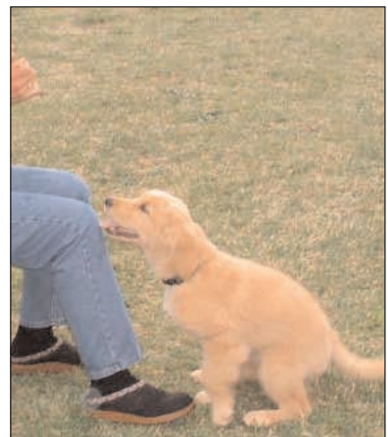
Photo 6: Feeling the pressure on her foot, she puts all four feet back on the ground!