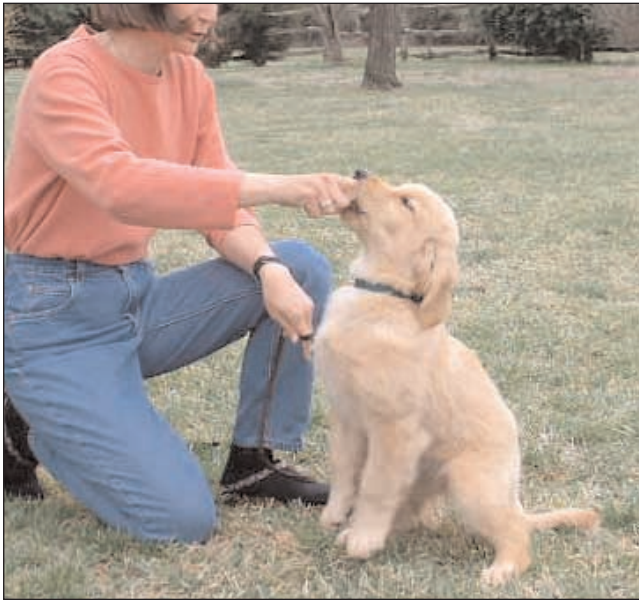
Photo 2: Cinda sits for the treat. The treat is a bit too high, as her front feet come off the ground to try to get it from me.

(10-15 feet) around the house or yard, or whenever you are in a situation where he might not allow you to catch him. First, this will allow him to grow accustomed to being on a leash, and it will also afford you the ability to catch him if he starts to run from you.