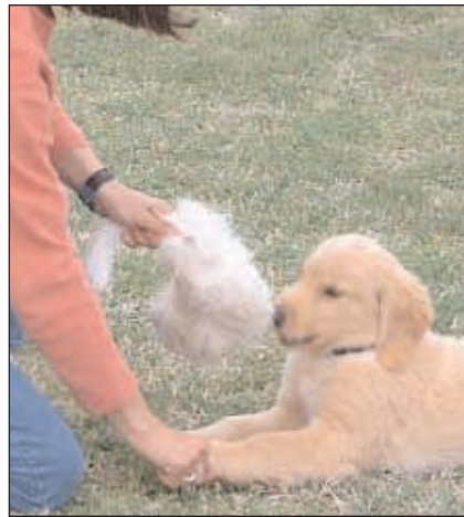
Photo 8: She opens her mouth immediately when I squeeze her foot, and I praise her for dropping on command!